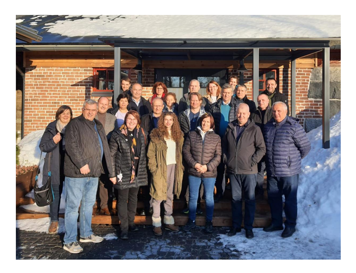
Figure 4: Project participants on the day of the excursion - Ponsse, Vieremä, Finland

• Among other project management topics, the program also included a study trip to Ponsse (manufacturer of forestry machinery) and a visit to the campus in Kuopio. Here, opportunities for cooperation between industry partners and universities were discussed and the importance of cooperation between agricultural partners, university and industry was made clear.