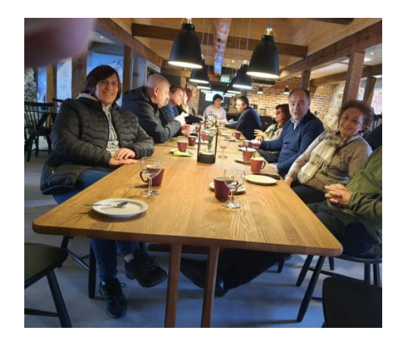
Figure 8. Free time at Savonia University