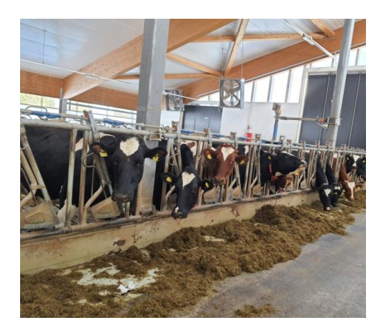
Figure 7. Training activities at Savonia University