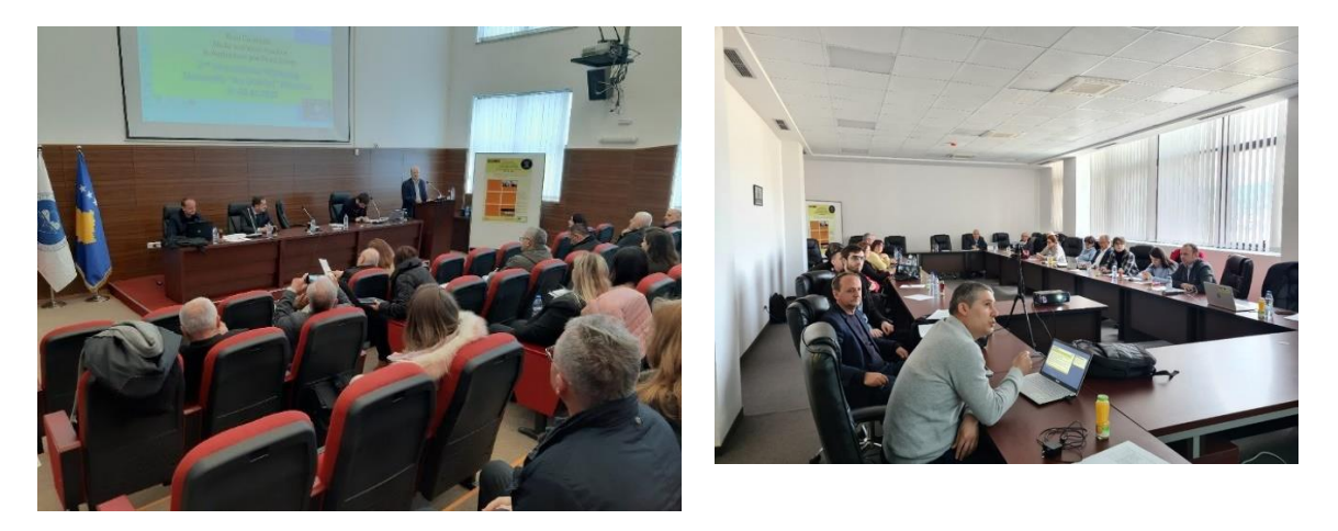
Figure 1: Participants attending the 2nd international workshop at UIMB

and public institutions showed that there is a need for practice-oriented curricula, training during studies, and development of skills related to digitalization. In UIBM and UPHP by current curricula was advanced by increasing the practical component. Units of LLL have started their establishment in the HEIs in Albania and Kosovo and will offer trainings in the agriculture and food sectors.