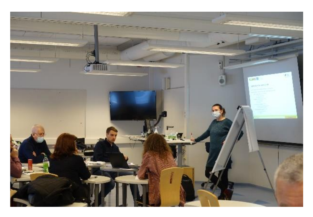
Figure 3: Presentations on practical studies in Savonia by host university staff (left) and discussion among group members on how to improve project outcomes.

• An important part of this year's Steering Committee meeting was the self-evaluation of the project activities to date. Such a review takes place regularly and is led by experts from the European partners (Savonia/NGU). The aim is to promote the strengths of the project cooperation, but also to identify difficulties that can be addressed and improved in the follow-up period. Such quality management ensures that the set goals can be achieved efficiently.