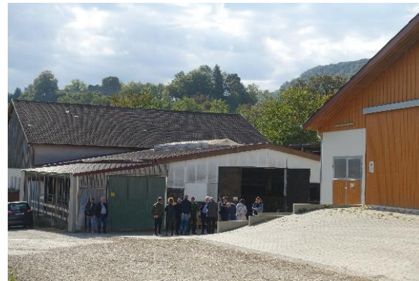
Figure 2: Project participants on the field trip and campus tour