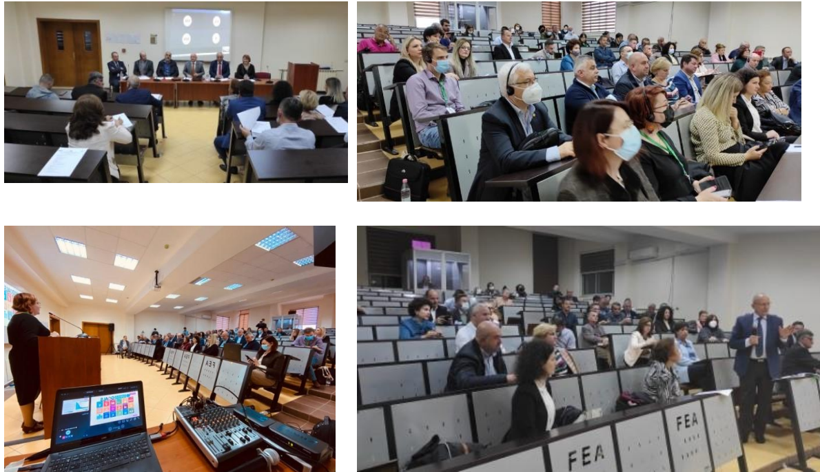
Figure 3: Participants attending the workshop organized at AUT

This seminar was attended by project partners from DualAFS, professors of University of Molise Italy, the University of Tetova and the University of Skopje, representatives of about 30 farms and other livestock and food enterprises, other representatives from the Ministry of Agriculture & Rural Development, the Agency for Agricultural & Rural Development (ARDA), the National Employment Agency and Skills, representatives for GIZ projects - Germany and RisiAlbania Helvetas Swiss Intercooperation, as well as principals of vocational high schools in the field of agriculture.