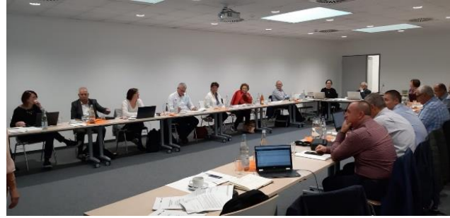
Figure 1: Project participants at Nürtingen-Geislingen University,