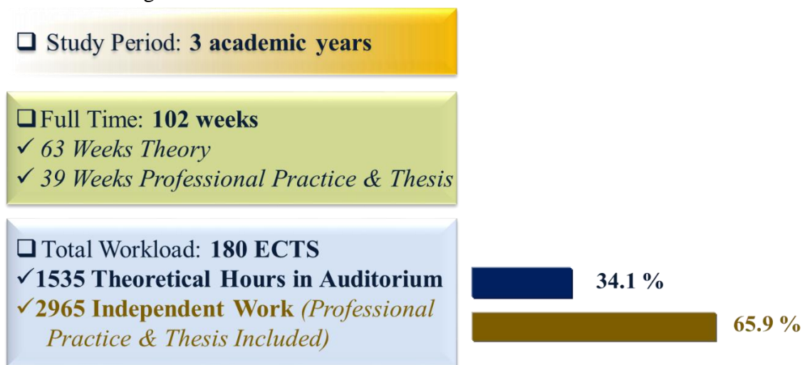
Figure 1. Distribution ration between theory and practice and total work load

The structure of the re-organized bachelor curricula in “Agribusiness Management” is as indicated on the figure below.