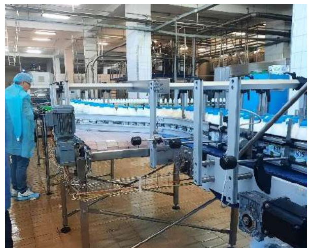
Visit of the Lufra milk processing factory in Bishqetëm, Albania.

All the experiences and encounters with people from Kosovo, Albania and Finland were beneficial for us and our work at NGU. We are looking forward to further possibilities to work and to do further research with partners in Albania and Kosovo in the future.