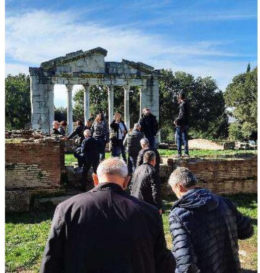
Visit of the Apollonia exhibition in Pojan, Albania.