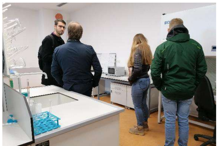
Visit of the laboratories of UMIB.