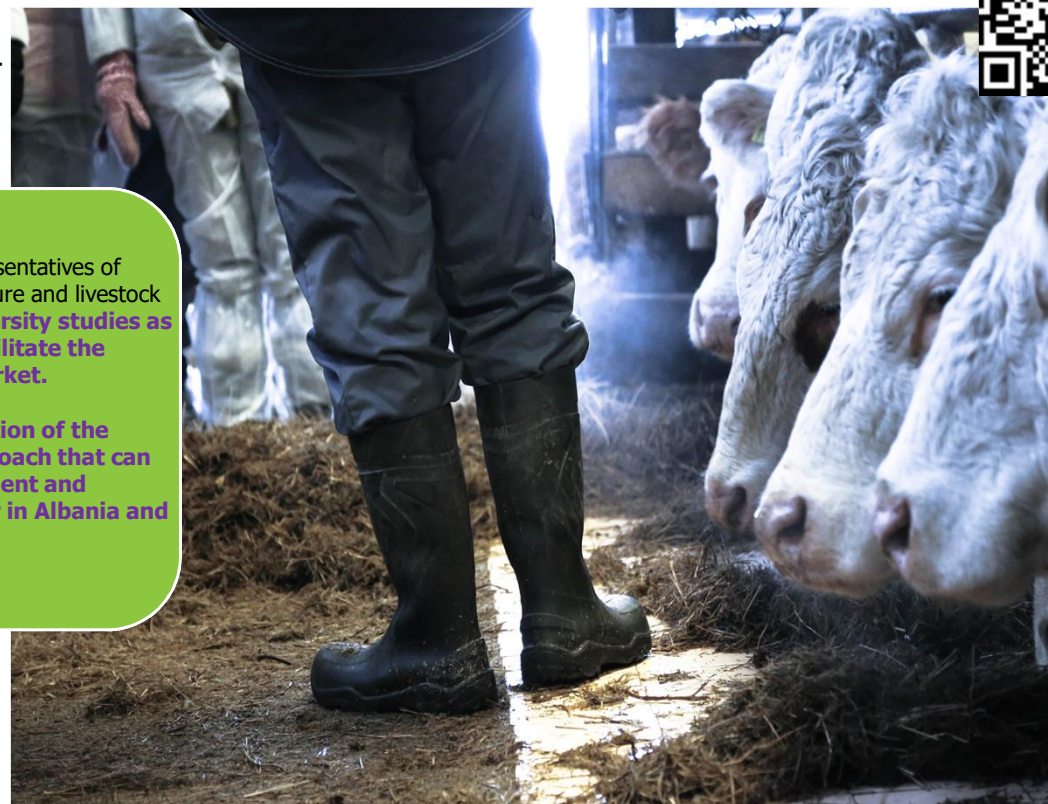
Picture 1. Practical teaching in the farm